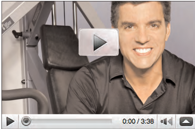
JIM KARAS INDUSTRIES